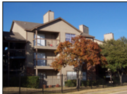
Hunter's Run Apartments (Dallas, Texas)